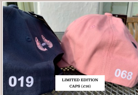
LIMITED EDITION CAPS (£16)

The Neston Club merchandise is available on-line. We have Umbrellas, Ties and Caps in stock, available behind the bar or you can pick them up from the office. Or order the Jumpers, Polos and Mid -Layers on-line. All profit goes back into the Club!