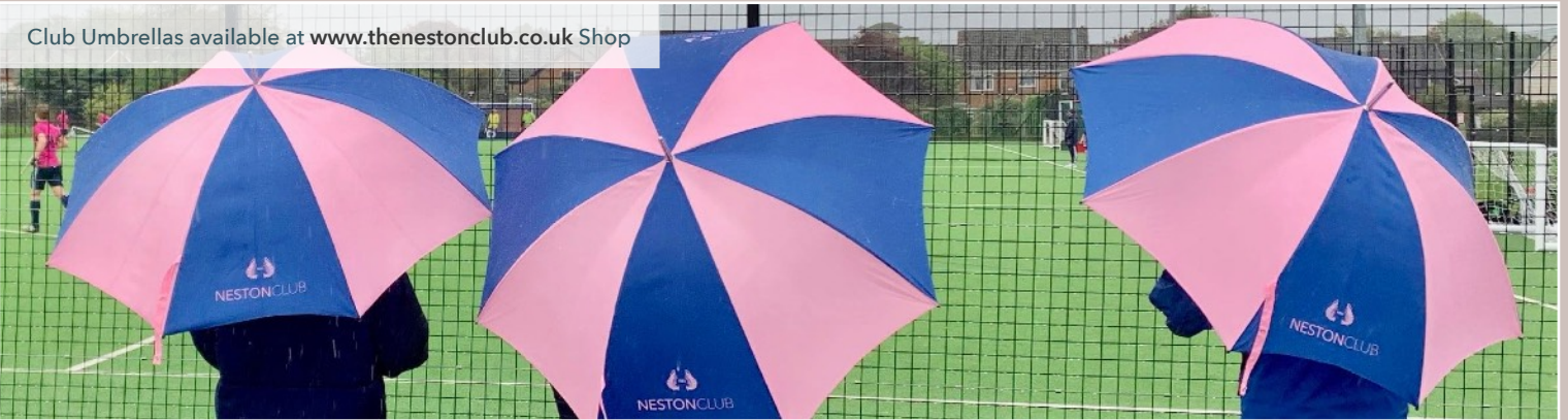
The Hockey season was cut short shortly, however there are going to be Summer Leagues, hopefully without the need for Umbrellas!

Club Umbrellas available at www.thenestonclub.co.uk Shop