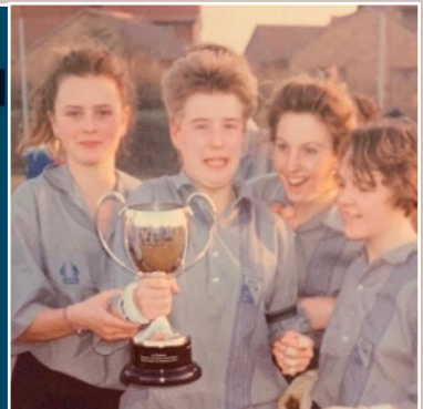
It is 30 Years since Neston U18 Girls Hockey, represented England in The U18 European Championships.