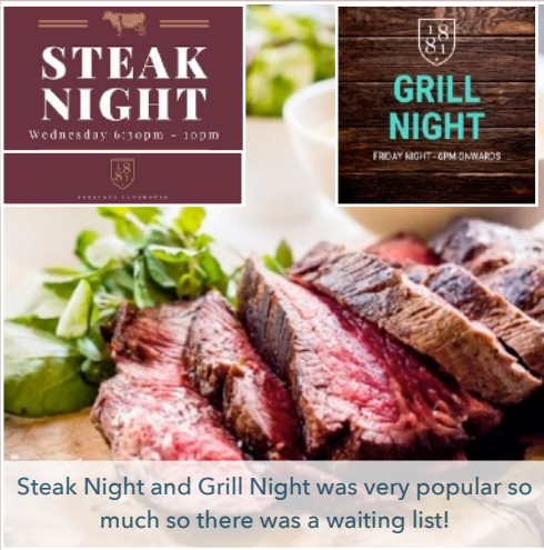
Steak Night and Grill Night was very popular so much so there was a waiting list!