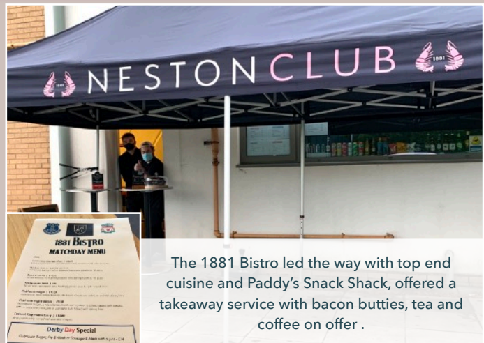
The 1881 Bistro led the way with top end cuisine and Paddy's Snack Shack, offered a takeaway service with bacon butties, tea and coffee on offer .