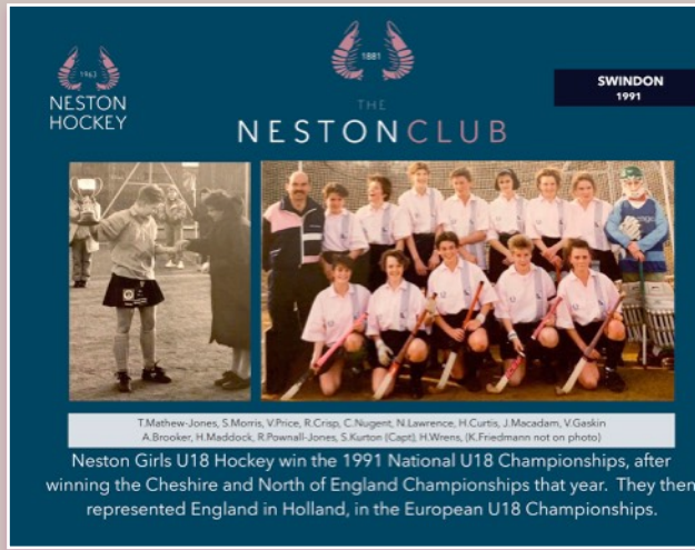
Neston Girls U18 Hockey win the 1991 National U18 Championships, after winning the Cheshire and North of England Championships that year. They then represented England in Holland, in the European U18 Championships.