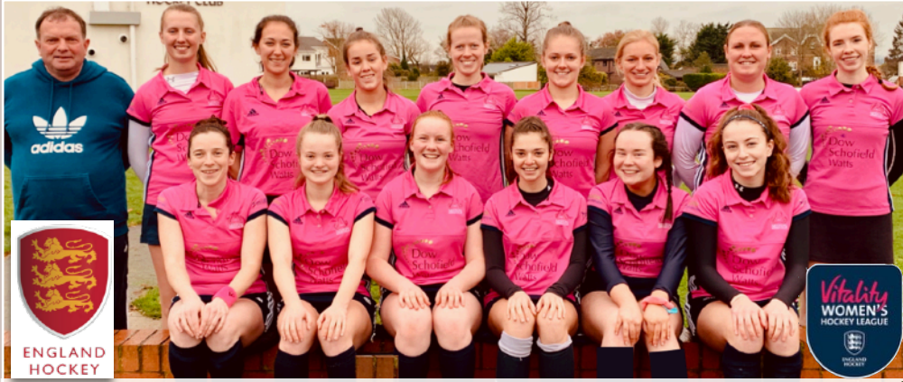
Congratulations to the Neston Clubs Ladies Hockey 1st team who have been promoted to the Vitality National League, for the first time. They will start the season in September 2021!