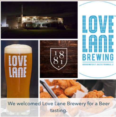
We welcomed Love Lane Brewery for a Beer tasting.