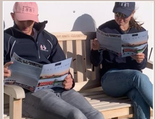
The Shrimp Magazine, proves to be an avid read! It brings all the news of the past 6 months into one and has The President's message!