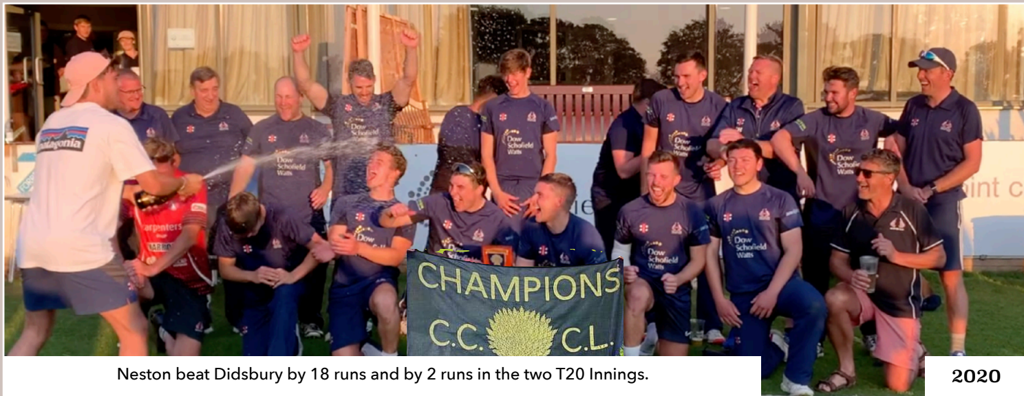
Neston beat Didsbury by 18 runs and by 2 runs in the two T20 Innings.